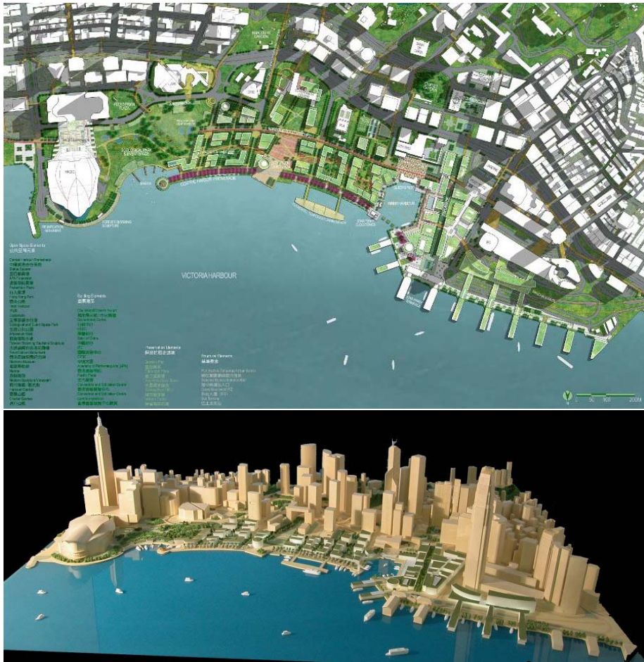
(top) MLP of finalist no. 503 (bottom) model photo of finalist no. 503 2