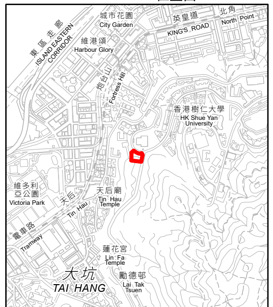
SCALE 1 : 20 000 比例尺

界线只作识别用并有待详细测量 BOUNDARY FOR IDENTIFICATION PURPOSE ONLY SUBJECT TO DETAILED SURVEY