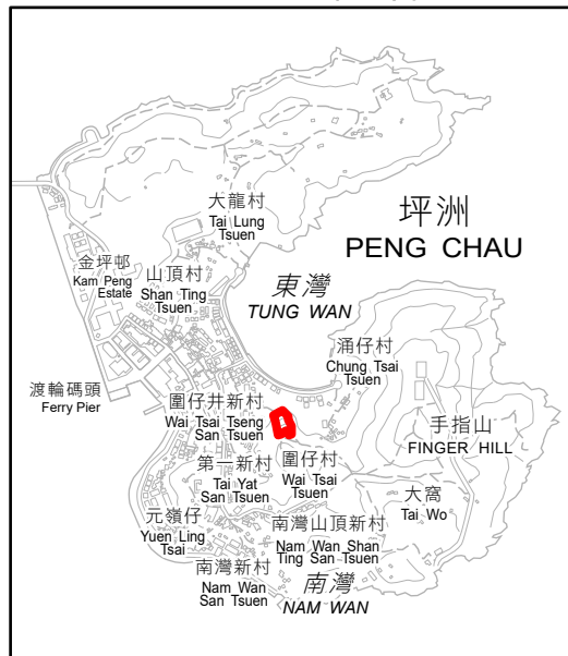
SCALE 1 : 20 000 比例尺

界线只作识别用并有待详细测量 BOUNDARY FOR IDENTIFICATION PURPOSE ONLY SUBJECT TO DETAILED SURVEY