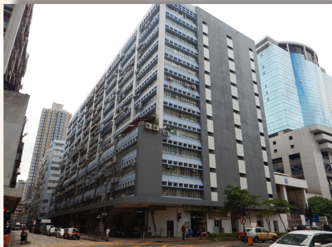
Private industrial building

Since 2000, the Department has been undertaking area assessments of industrial land in the territory in every four to five years. In September 2019, the Department started a new round of study to obtain an overview on the latest utilisation of private industrial buildings and consider planning of industrial land to meet the changing needs of economic land uses and optimise the utilisation of land resources. The Study comprises on-site questionnaire surveys and in-house planning assessments. The on-site questionnaire surveys were largely completed in December 2020. The study is scheduled for completion in 2021.