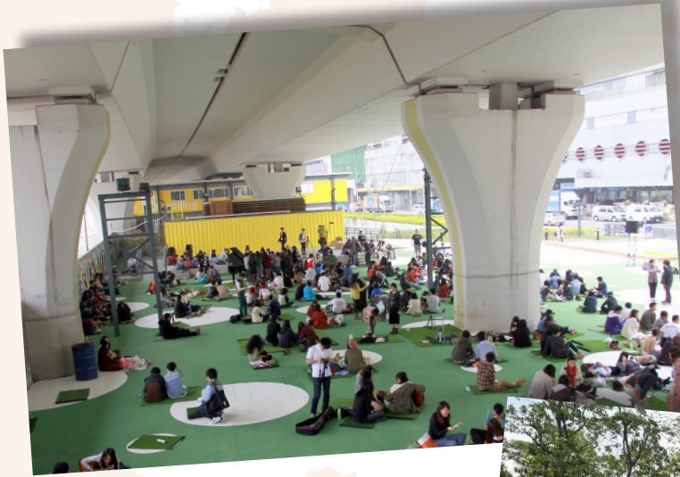
Welcoming public open space under Kwun Tong Flyover