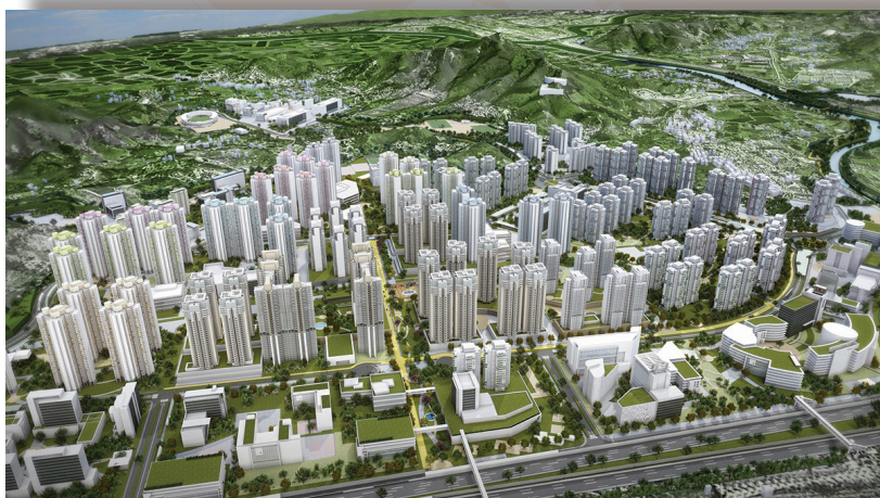
Concept Plans for Town Plazas in Kwu Tung North and Fanling North NDAs

Several rounds of consultation have been conducted with the Urban Design Advisory Group (UDAG) on the proposed urban design concept with the latest round in September 2020. The guidelines would be further refined taking into account UDAG's comments on such aspects as creation of a vibrant town plaza, climate resilience and integration with railway station.