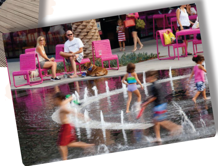
Activity nodes along the waterfront promenade