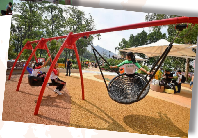
Inclusive playground in Tuen Mun Park